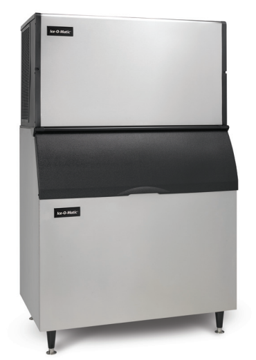
ICE1806 on B100